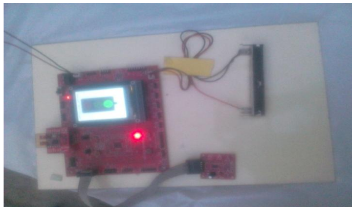
Fig. 2 Hardware model of traffic system

The output model for the traffic signal application is shown below in figure 2.